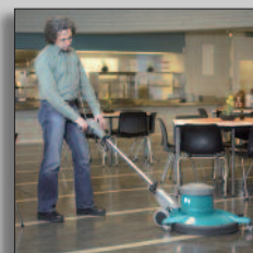
Machine in action